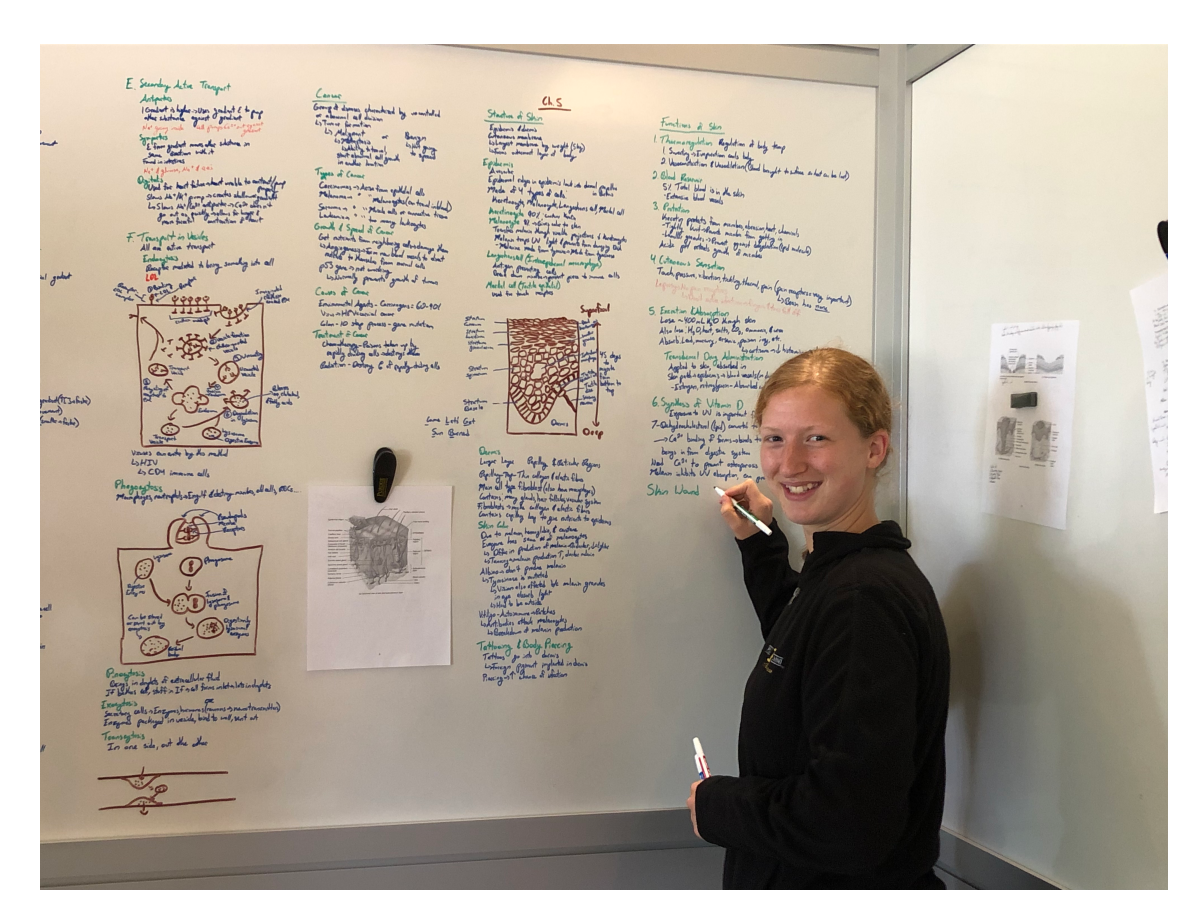
Office hours with faculty and grad students in the residence hall lounges!