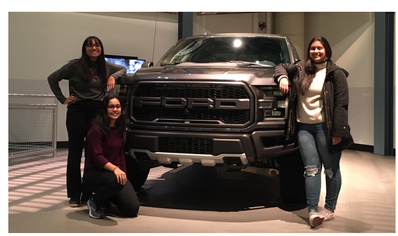
Student visit to Ford in Michigan, Fall 2019