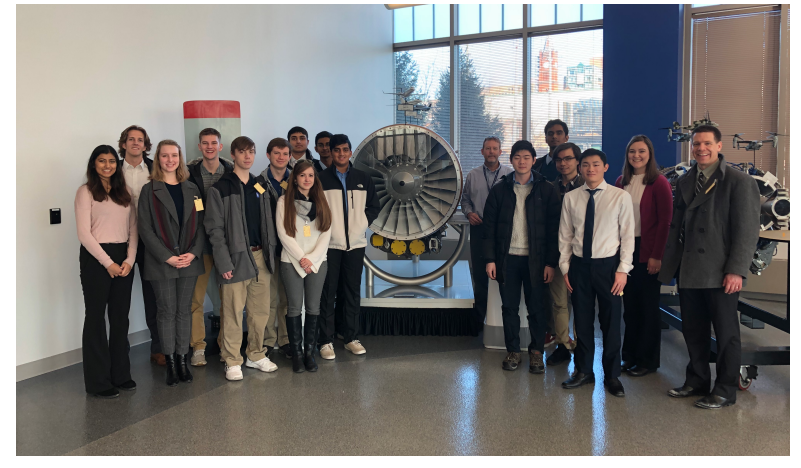
Student visit to Rolls-Royce in Indianapolis, IN, Spring 2020