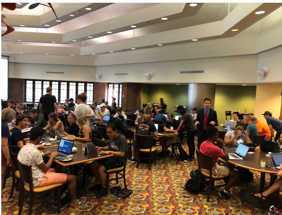
datamine.purdue.edu > Education > STAT 190 or 290 or 390 or 490